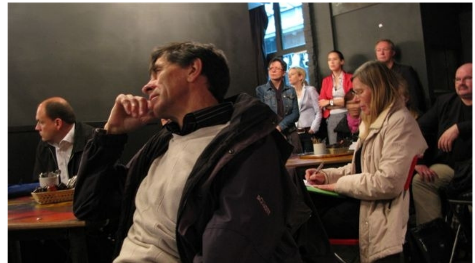
Kick-off, Maastricht, May 2010