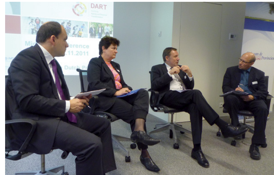
Midterm conference, Brussels ,Nov 2011