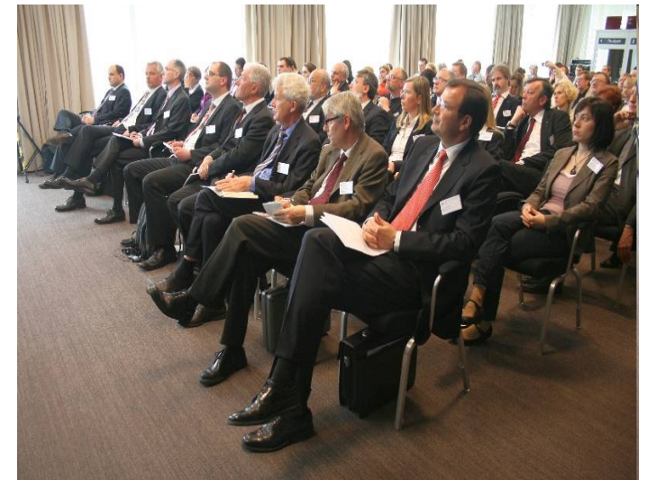
Economy, Conference, Dresden, April 2011