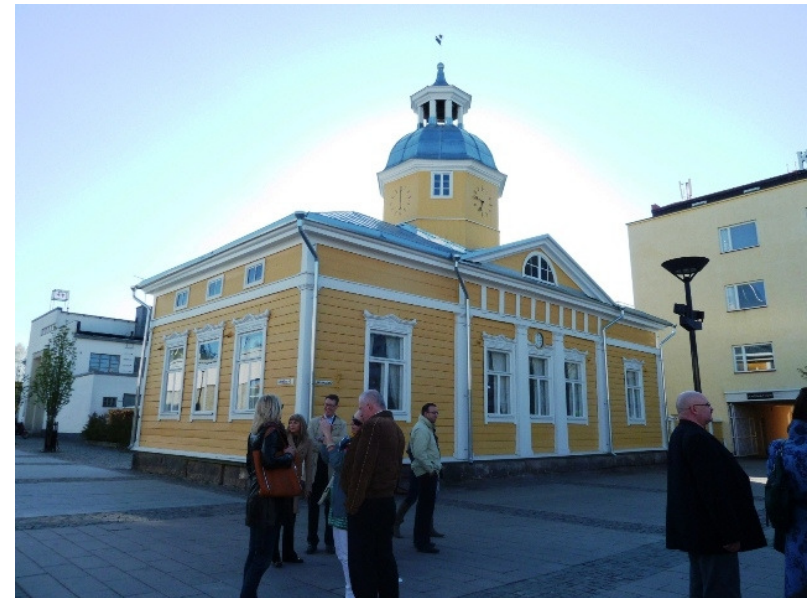
Health, Conference, Kainuu, May 2011