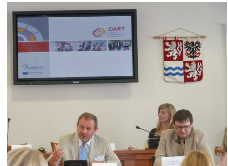
Education, Conference Prague ,June 2011